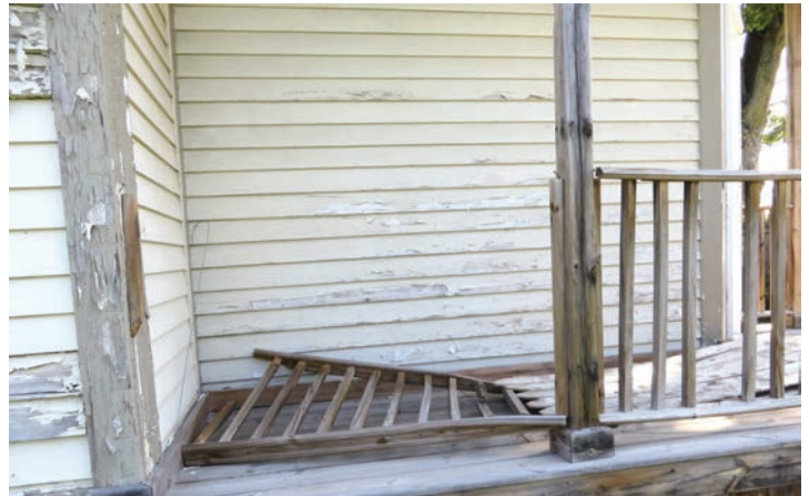
Bank of America failed to reattach the porch railing.

Meanwhile, BoA keeps its foreclosures in white neighborhoods in good condition, mowing and edging lawns regularly, and properly disposing of the belongings left behind by former owners. BoA is paid to