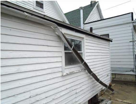
Bank of America failed to reattach the gutter here, a quick, easy fix.

On August 31, Toledo Fair Housing Center joined the National Fair Housing Alliance (NFHA) and other local fair housing organizations to file an amended discrimination complaint against Bank of America (BoA), alleging illegal discrimination in African American and Latino neighborhoods. The complaint is now comprised of evidence from 1,267 BoA properties in 30 metropolitan areas and 201 cities throughout the United States.