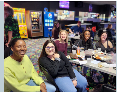
SBA students helped raise funds and awareness for TFHC at Strike Out Discrimination.

Each April, in recognition of the landmark Fair Housing Act of 1968, The Fair Housing Center celebrates Fair Housing Month through a series of community events and initiatives. This year, we kicked off the month with a Community Breakfast at the ProMedica Ebeid Center on April 2, partnered with the University of Toledo Student Bar Association for Strike Out Discrimination at Miracle Lanes on April 12, hosted our annual Ode to the Zip Code Poetry Contest at the Main Library on April 18, and concluded the month by honoring local fair housing advocates at our Homes & Dreams Fundraiser at the Toledo Club on April 30.