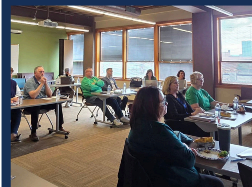
Bottom Left: Real estate agents from Howard Hanna participated in a Continuing Education training with TFHC on May 13.

Bottom Right: Free trainings and resources for housing professionals are available. Contact us today!