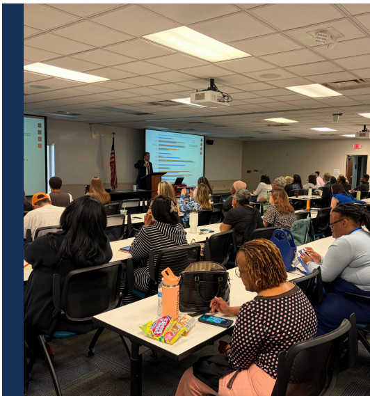
Top Left: Community members and social services workers spent an afternoon learning about the harmful effects of redlining in Toledo on April 14.